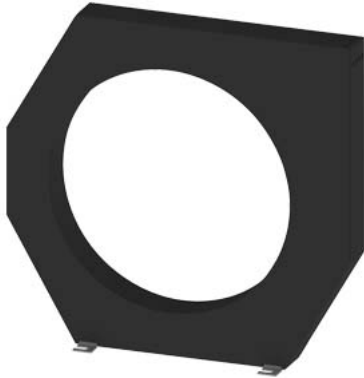
Residual-current transformer for residual current monitoring Bushing opening 210 mm Residual current 30 mA...40 A