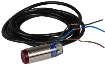
photo-electric sensor - XUB - emitter - 12..24VDC - cable 2m

Local distributor code: 388762840 XUB0BKSNL2T